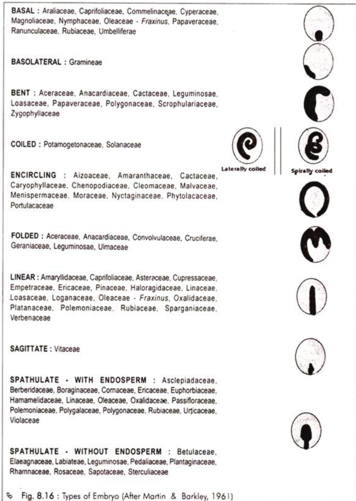
Fig. 8.16 : Types of Embryo (After Martin & Borkley, 1961)