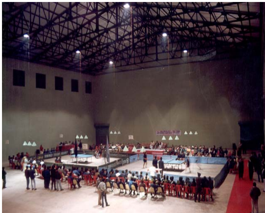
Madhav Rao Scindia Gymnasium